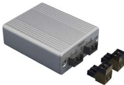
Figure 2 - Attach and detach the kickAMP's speaker quick-connectors for maximum amplifier portability.

A- The connectors are designed to quickly attach and detach speakers to or from the amplifier for maximum portability. They can be disconnected by pulling them straight out and reconnected by pushing them in until they click (see Figure 2). Use more connectors (available from NetMedia) to integrate additional speakers and locations into your kickAMP sound empire.