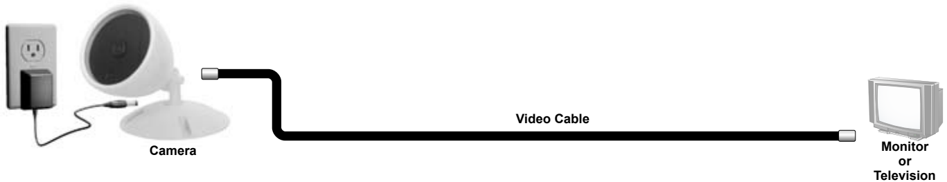
Figure 1 - Connecting the camera to a security monitor or standard television. Use the TV's composite RCA Video In jack and view through its video or line input. The picture will not be available on a channel.