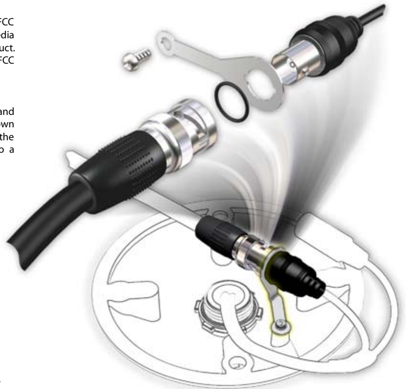
Figure 4 - Grounding the camera through the base with a grounded coax

No expressed or implied warranty is made for any defects in this product which result from accident, abuse, failure to operate the product in accordance with relevant instructions, neglect, immersion in or exposure to chemicals or liquid, extreme climate, excessive wear and tear and defect resulting from other extraneous causes such as unauthorized disassembly, repair and/or modification. Any implied warranty arising from the sale of this product, including implied warranties of merchantability and fitness for a particular purpose, are limited to the warranty stated above. NetMedia shall not be responsible for any loss, damages or expenses, whether direct, consequential or incidental that arise from the use or inability to use this product. Some states do not allow limitation of incidental or consequential damages, so the above limitations and exclusions may not apply to you. This warranty gives you specific legal rights, and you may have other rights, which vary from state to state.